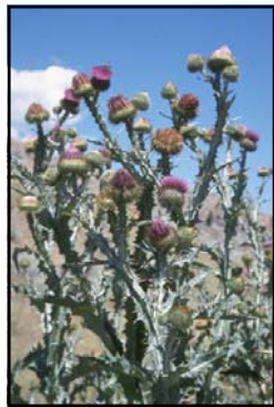
SCOTCH THISTLE LIST B