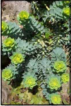
MYRTLE SPURGE LIST A

List C: Widespread and well-established noxious weed species for which control is recommended but not required by the State, although local governing bodies may require management..