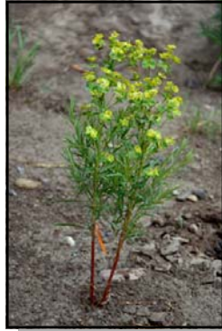
LEAFY SPURGE LIST B