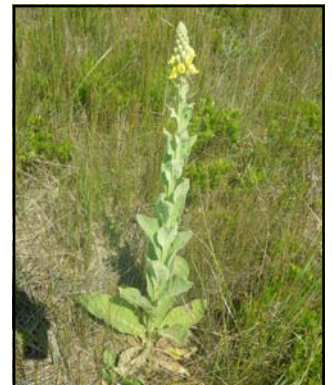
COMMON MULLEIN LIST C