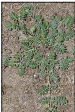
PUNCTUREVINE LIST C