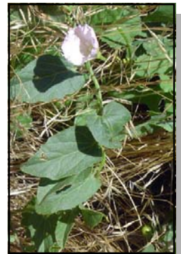
FIELD BINDWEED LIST C