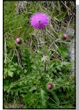
MUSK THISTLE LIST B