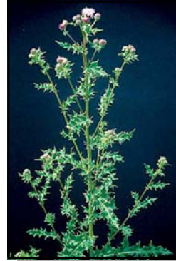
CANADA THISTLE LIST B