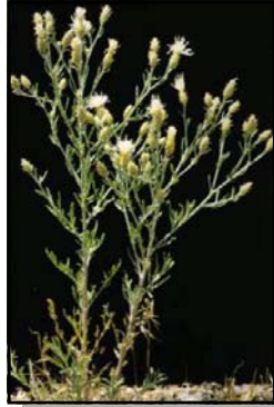
DIFFUSE KNAPWEED LIST B