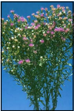
RUSSIAN KNAPWEED LIST B