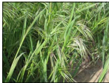
DOWNY BROME LIST C