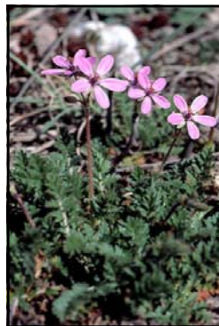
REDSTEM FILAREE LIST C