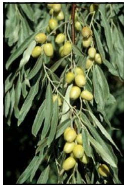
RUSSIAN OLIVE LIST B