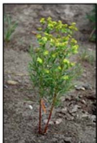
LEAFY SPURGE LIST B