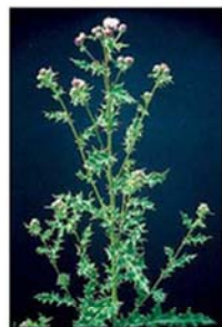
CANADA THISTLE LIST B