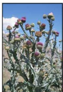
SCOTCH THISTLE LIST B