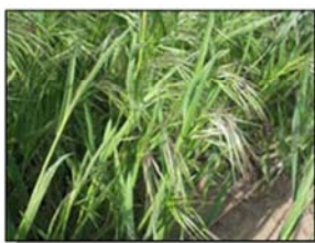
DOWNY BROME LIST C