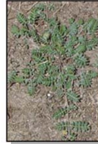
PUNCTUREVINE LIST C