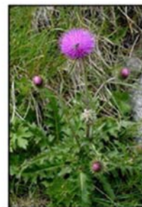
MUSK THISTLE LIST B