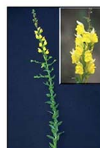
DALMATION TOADFLAX LIST B