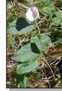
FIELD BINDWEED LIST C