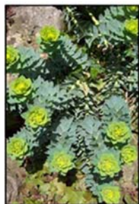
MYRTLE SPURGE LIST A

List C: Widespread and well-established noxious weed species for which control is recommended but not required by the State, although local governing bodies may require management..