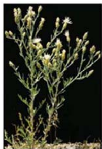
DIFFUSE KNAPWEED LIST B