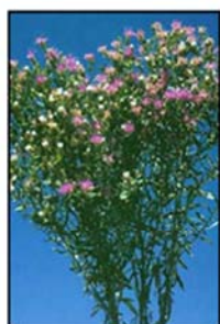
RUSSIAN KNAPWEED LIST B