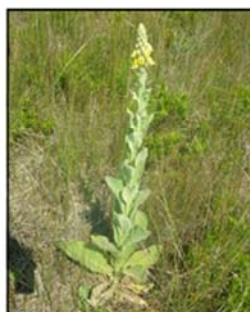
COMMON MULLEIN LIST C