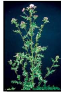
CANADA THISTLE LIST B