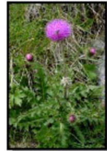
MUSK THISTLE LIST B