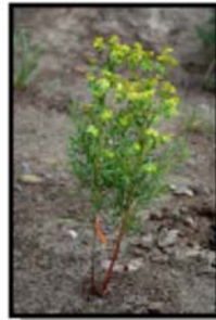
LEAFY SPURGE LIST B