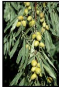
RUSSIAN OLIVE LIST B