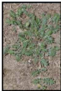
PUNCTUREVINE LIST C