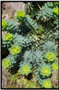
MYRTLE SPURGE LIST A

List C: Widespread and well-established noxious weed species for which control is recommended but not required by the State, although local governing bodies may require management..