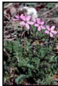
REDSTEM FILAREE LIST C