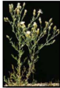
DIFFUSE KNAPWEED LIST B