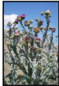
SCOTCH THISTLE LIST B