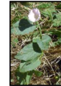
FIELD BINDWEED LIST C