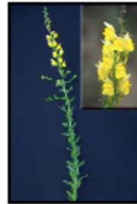
DALMATIAN TOADFLAX LIST B