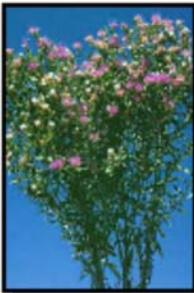
RUSSIAN KNAPWEED LIST B