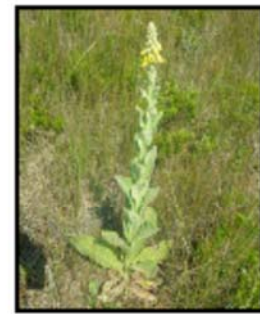
COMMON MULLEIN LIST C