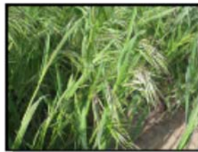
DOWNY BROME LIST C